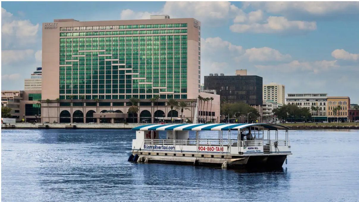
Hyatt Regency Jacksonville Riverfront

9:00am-1:00pm – Exhibit Hall Open _____ Conference Center A/B